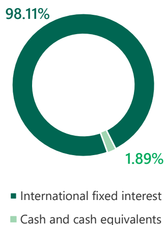
Actual investment mix ii