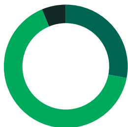
Actual investment mix

This shows the types of assets that the Fund invests in.